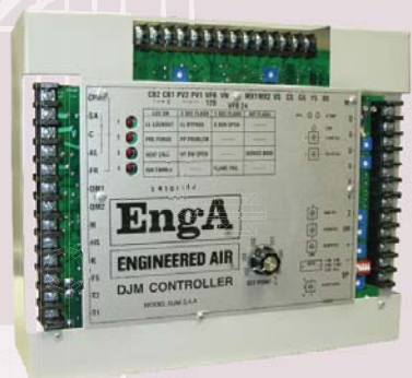
DJM Control Module