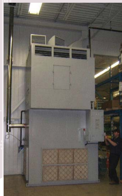
DJX Air Turnover

The DJX heat exchanger was engineered to operate at nominal 90% efficiency throughout its complete firing rate and with increased efficiency during part load conditions. The DJX Series exceeds standards and optimizes energy performance.